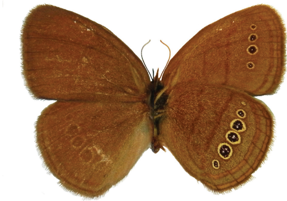
FIG. 1. Dorsal (left) and ventral (right) wing pattern from the right wing of a male N. mitchellii specimen collected at the Kellogg Biological Station in 1953. This population was extirpated in the 1960s.

and the average female two to four days (Szymanski et al. 2004).